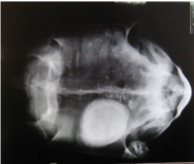
X-ray shows Bigfoot's 4-inch bladder stone that was successfully removed with surgery