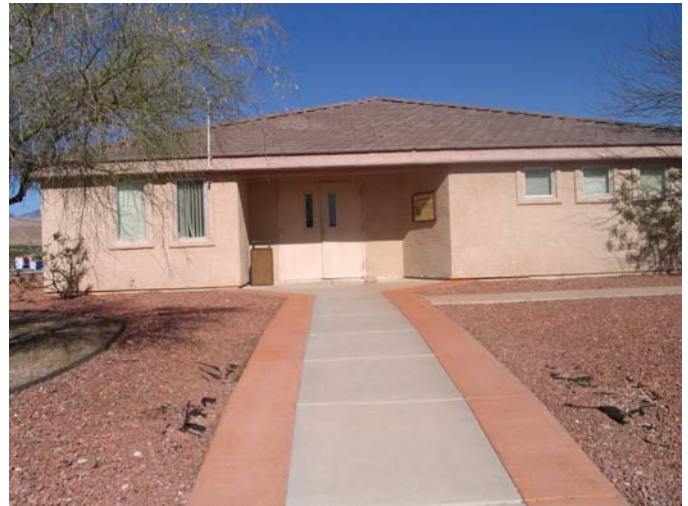
Desert Tortoise Conservation Center building