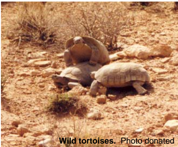
Wild tortoises. Photo donated

New Directions: Travel west on Blue Diamond to Buffalo (app. 1 mile west of Rainbow, the old turnoff). At Buffalo, turn left (south) and continue until it ends at Starr Rd. Turn left (east) to Rainbow. Again turn left and go a very short distance to the power line road, which takes you to the DTCC. Only the power line road is unpaved now! Look for the Tortoise Group signs.