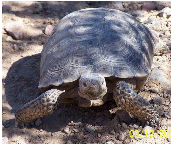
Handsome wild tortoise. Photo donated

If you haven't sent in your membership yet, remember that the year 2006 will be the last year that you can purchase a Life Membership for $200. Beginning in 2007, the amount will increase to $500. Get this deal while it's hot!