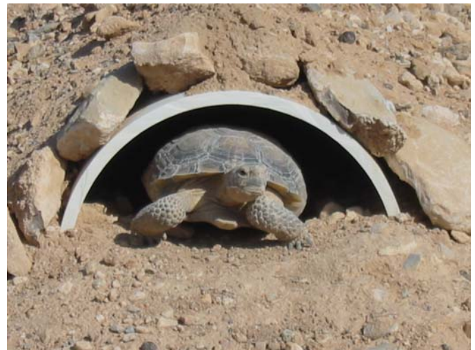
Good-looking tortoise emerges from its burrow at the Desert Tortoise Conservation Center in Las Vegas.