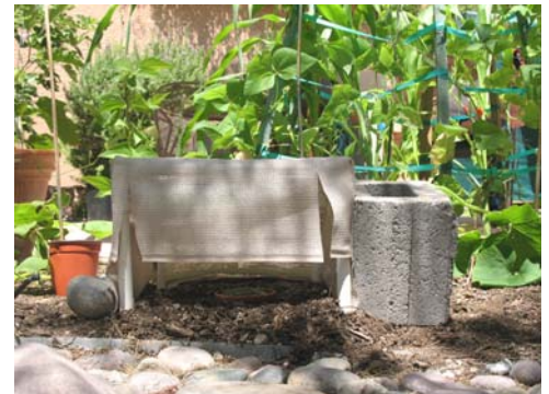
3. Insert legs in ground until side cloth lies on ground 2-3". Hold cloth sides down with something heavy. Slit front cloth so door flaps.