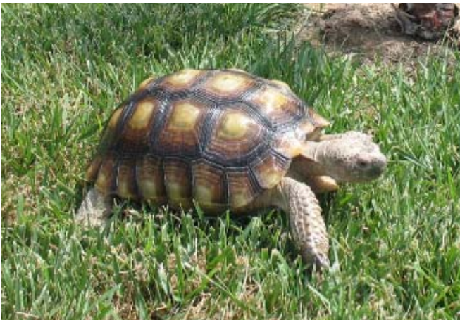
Shelley is no longer trapped in her burrow

TG Can you see her eyes? Have you seen her move? If so, does she appear to be free to move forward and out? Could she be stuck? If not, I suggest you poke her gently and listen for an exhalation of breath or movement.