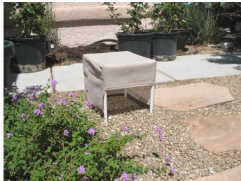
2. Sew a snug cover from shade cloth, leaving 2-3" each leg uncovered