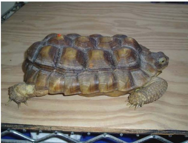
Malnourished tortoise: soft shell, pyramided scutes, splayed hind nails and can't support its own weight

Soft shell – Even if your tortoise has a proper diet, it must get free access to heat and light outdoors from the sun. Otherwise, it is not able to properly digest its food so it sucks calcium out of its bones and shell, causing them to become soft. When people keep tortoises indoors, particularly young tortoises and hatchlings, these tortoises literally turn to soup from the inside out. Think of it this way – every day that a tortoise lives indoors is a day that it spends dying.