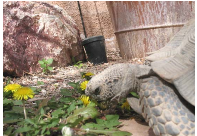
Mmmm. Dandelions—my favorites!

If you have a mating pair of desert tortoises, be prepared for hatchlings to arrive from late August through September. Since it is not legal to give tortoises to another person, please call the Pet Desert Tortoise Hotline at 702-488-9422 to pick up the hatchlings and take them to the Desert Tortoise Conservation Center where they will be cared for.