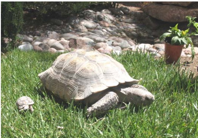
From hatchling to grownup

The August meeting will continue the same effort, refining and reworking. Watch for it! The September meeting will bring the unveiling of the New Tortoise Group!