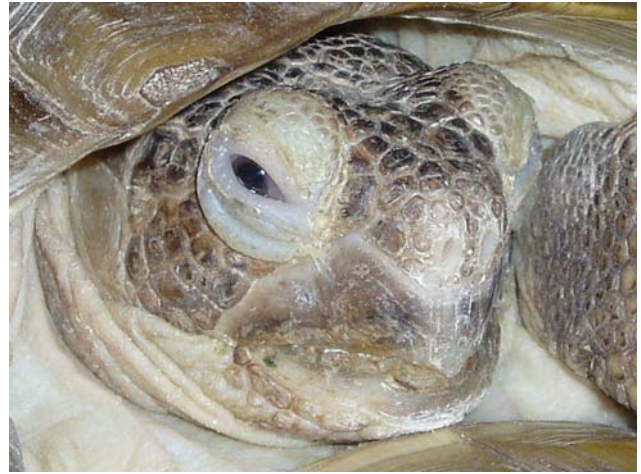
Nutritional deficiencies cause bulging eyes

Bulging eyes – Bulging eyes may be from nutritional deficiencies, or it can be related to a disease process. It is often seen in combination with soft shell and/or discoloration.