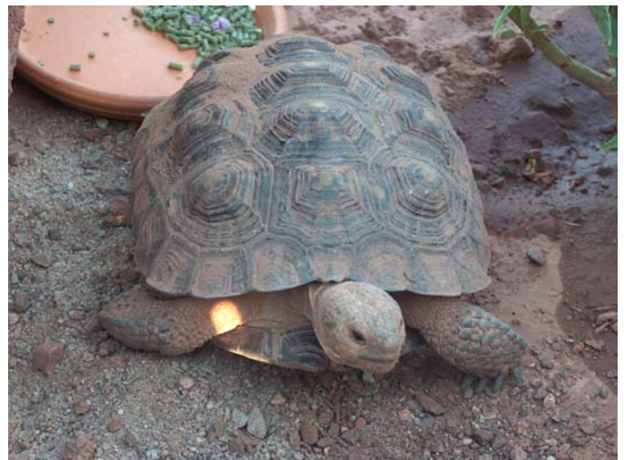
Good new growth (curved not pyramided) shows on Trekette's scutes since she began eating MegaDiet

TG The amounts listed on the package are more like minimum amounts. You can safely give your little tortoise as much MegaDiet as it wants. However, you do want the tortoise to learn to browse so that it doesn't depend entirely on you for food. Giving it desert willow flowers and letting it browse on grass, dandelions, and flowers is perfect. That way, it can feed itself and you don't have to worry when you are not at home to offer MegaDiet.