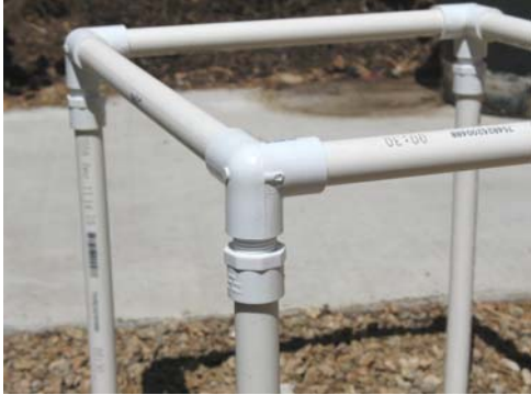
1. Build a frame 12" x 12" x 14" high from PVC pipe

When we put out MegaDiet pellets so that our tortoise can browse whenever it likes, the birds swoop right in and eat up all the MegaDiet. They love it, too! What is the solution? Build a blind that allows the tortoise to enter but is intimidating to birds and keeps them out.