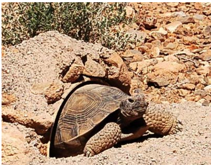
Tortoise emerges from his burrow at the Desert Tortoise Conservation Center during the Tortoise Group tour.