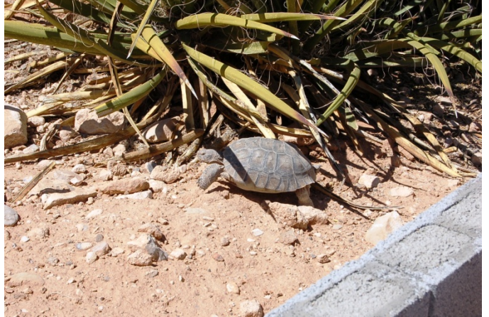
Tortoise basks in the April noon sun at the Desert Tortoise Conservation Center