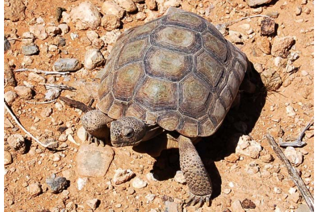
Juvenile at the Desert Tortoise Conservation Center saying "hi!"

checks on to the Treasurer, who also does some processing and then deposits the checks. It could easily be 6 six before the cycle is completed if your check was dated near the beginning of the month. We ask that you have patience, as we are all volunteers. And if you ever have a question, please do contact us.