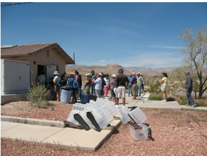
Tour members peek in the veterinary building. Foreground: Plastic totes for transporting tortoises dry in the sun

We always wondered how our Sammy was doing. So when we heard about this year's Tortoise Group's tour to the DTCC, I asked if it might be possible to see Sammy during the tour. They told me that if she was out they would bring her in from the field as a very special favor. Sammy was out and as you can see from the look on my face, I was thrilled to see her looking so happy and healthy.