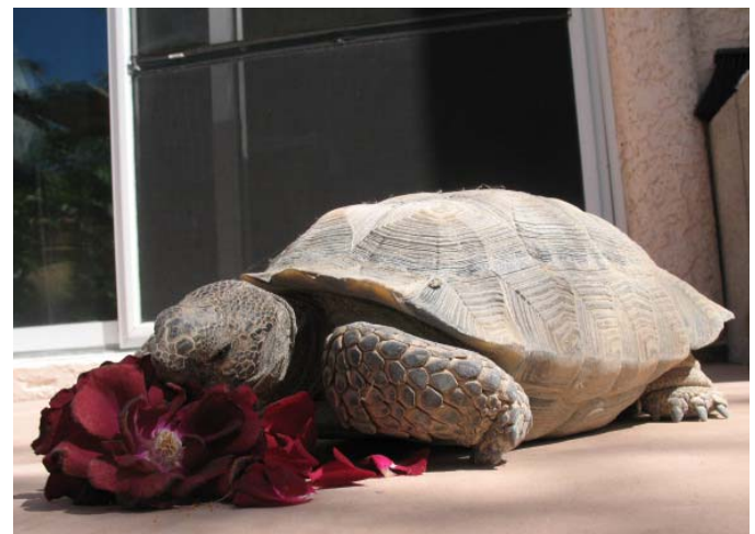
Tad bites into a favorite red rose grown organically without any pesticides.

Kathy will show lots of photos of habitats to give you ideas and walk through the basics, especially safety. Also, she will talk about plants for tortoises and the use of fertilizers and pesticides. We’ll examine some intriguing ways to make many different plants available for browsing.