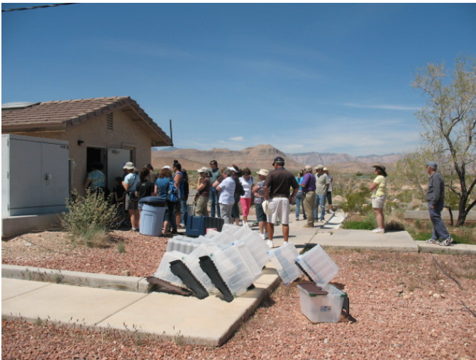
Tour members peek in the veterinary building. Foreground: Plastic totes for transporting tortoises dry in the sun

We always wondered how our Sammy was doing. So when we heard about this year's Tortoise Group's tour to the DTCC, I asked if it might be possible to see Sammy during the tour. They told me that if she was out they would bring her in from the field as a very special favor. Sammy was out and as you can see from the look on my face, I was thrilled to see her looking so happy and healthy.