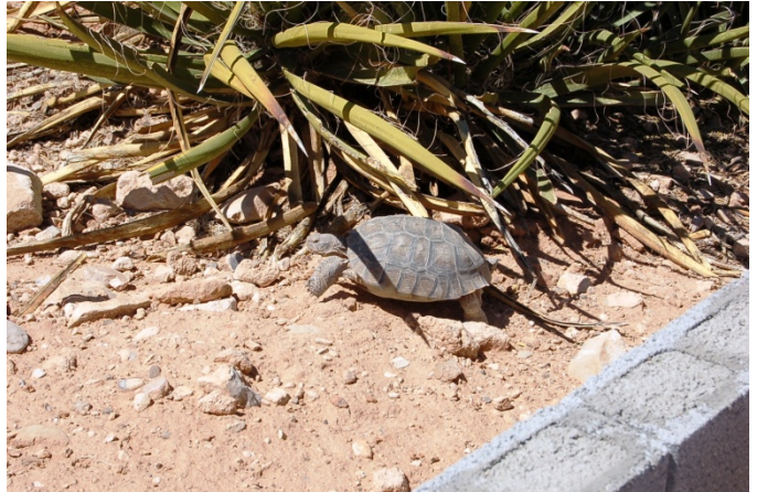
Tortoise basks in the April noon sun at the Desert Tortoise Conservation Center