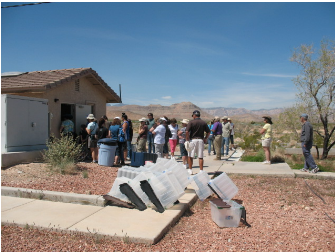
Tour members peek in the veterinary building. Foreground: Plastic totes for transporting tortoises dry in the sun