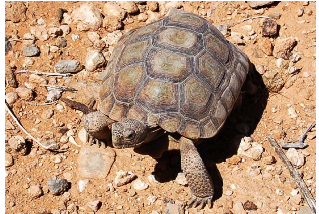
Juvenile at the Desert Tortoise Conservation Center saying "hi!"

checks on to the Treasurer, who also does some processing and then deposits the checks. It could easily be 6 six before the cycle is completed if your check was dated near the beginning of the month. We ask that you have patience, as we are all volunteers. And if you ever have a question, please do contact us.