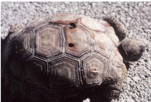
Lethal dog bites penetrated the carapace

Unfortunately, I often treat severely injured tortoises brought by very distraught and shocked owners who state, "Rover is always gentle, and I don't understand why he suddenly bit my tortoise. I came home from work and found the tortoise upside down next to the doghouse with blood all over the shell." My own golden retriever is the best, gentlest, cutest dog on the planet. But let's face it, she's a retriever. Her instinct is to retrieve her toy, her ball or anything that vaguely looks like a ball. Apparently, to many dogs, a moving tortoise looks like a slowly moving, easy-to-fetch toy or something to gnaw on.