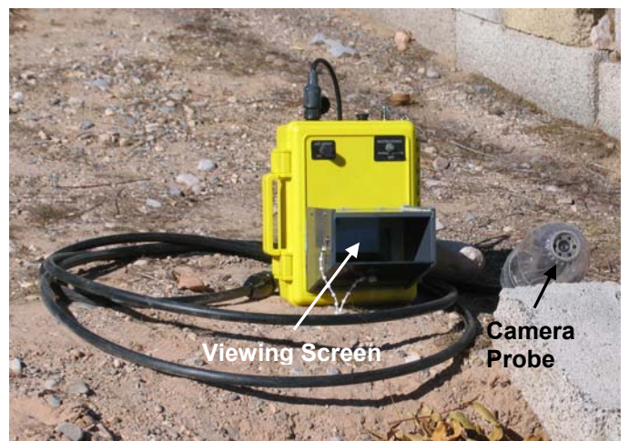
The Snooper, top view with probe to the right