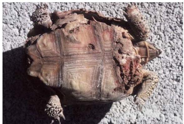
Shell is crushed and tissue exposed

Take quick action if Rover has injured a tortoise. Stop any bleeding with a small bandage, although it's difficult if the tortoise retracts its limbs into the shell. Gently wash any soil from the wounds with lukewarm water, not peroxide, being careful not to flush water into any deep bite holes. If the holes penetrate the shell, soil and other debris could be washed into the body cavity and result in more extensive infection. Cover any open wounds with a moist towel to prevent the exposed tissue from becoming too dry. Place the tortoise in a box or other secure container, keep the area dark, and take him to a reptile veterinarian as soon as possible. Remember, the best course of action in preventing these injuries is to keep Rover and tortoise separated!!