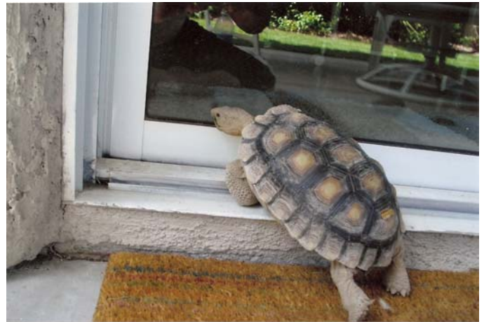
“Anybody Home” with Bruce by June Dolan

heat and cold in their environment. To prevent becoming too hot or too cold to function properly and in the desert to stay alive, the tortoise that is successful adjusts with its behavior, such as burrowing or basking. If an early riser were to return to the burrow each evening, it would lose much of the heat it gained during the day to the cold burrow air and soil. Yes, each night the exposed tortoise loses some of the heat gathered during the day but possibly not as much as it would if it returned to the burrow.