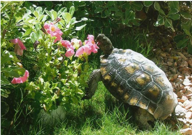
"When did these petunias get so tall?" with Franklin by Zan Korba. Winner of the Tortoise Alone category in the September 2006 Photo Contest