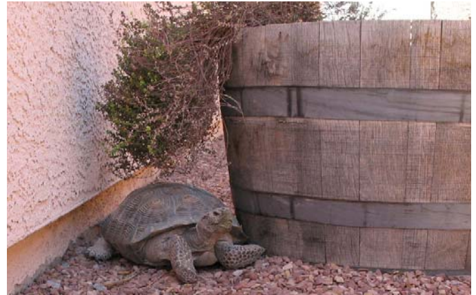
Tad rests in a cozy pallet created by overhanging thyme