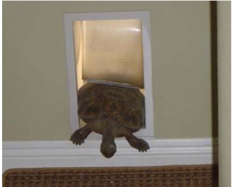
Charlie coming in through the doggy door

Sometimes Charlie walks over to the back door and climbs up to look into the window as he scratches. It's his way of saying, "I know you're in there! You can run but you can't hide!"