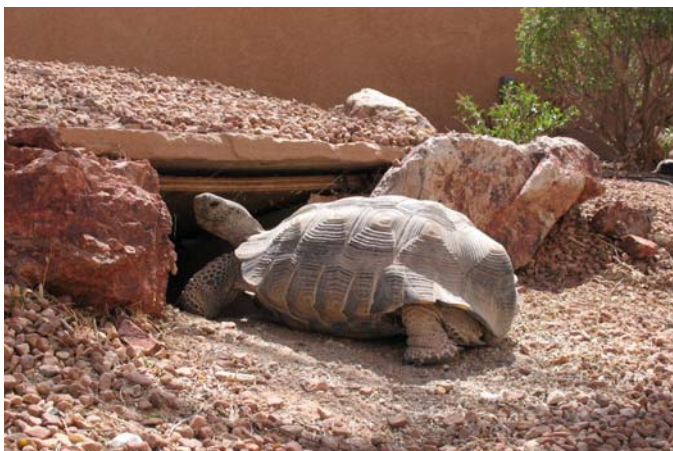
Tad basks for hours at this time of year with his head just in his burrow

Tad was born at my home 22 years ago from parents adopted from Tortoise Group. Just like any pet, he has had some ups and downs over the years. What a joy it is to watch and feed him and see him become more gorgeous, bossier (and more spoiled) with every year.