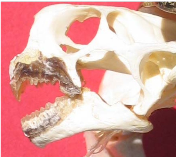
Tortoise has deeply serrated jaw coverings instead of teeth

Probably the most obvious feature of the chelonian digestive system is the lack of teeth. The chelonian's toothless jaws are able to function very well due to powerful jaw muscles and the presence of a very strong 'beak.' In desert tortoises and other larger herbivorous land tortoises, the jaw coverings are deeply serrated and, combined with the scissor-like action of the jaw, enable these animals to bite off pieces of plants that are then swallowed whole. The salivary glands produce extensive mucus that allows the tortoise to comfortably swallow such chunks of food. All chelonians have large fleshy tongues which are not able to protrude from the mouth. Tortoises locate food both by vision and their strong sense of smell.