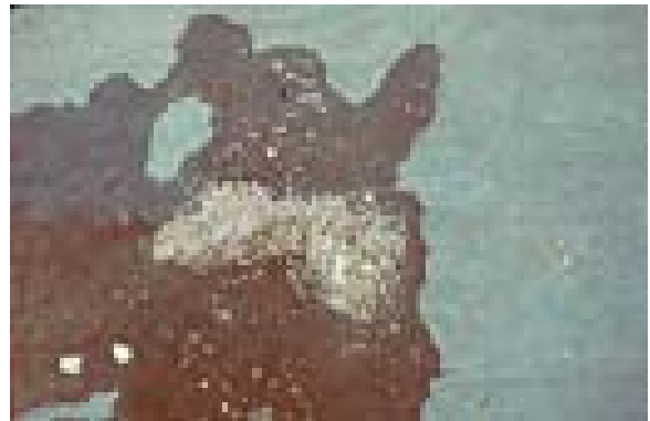
Tortoise urine with chunky white urate salts and clear-to-purplish fluid

The urinary tract of all reptiles, including tortoises, is very different from that of mammals. Chelonians such as desert tortoises have a need to conserve water, and they therefore produce very insoluble urinary wastes such as uric acid and other urate salts. These are passed from the body as a whitish material. Desert tortoises do have a urinary bladder which is important for water storage, particularly during times of drought. Water passes from the bladder into the body as needed. If you encounter a desert tortoise in the wild, you should never disturb the animal since they often release their bladder when they are picked up. Losing this source of internal water can result in severe dehydration and subsequent death in these wild tortoises.