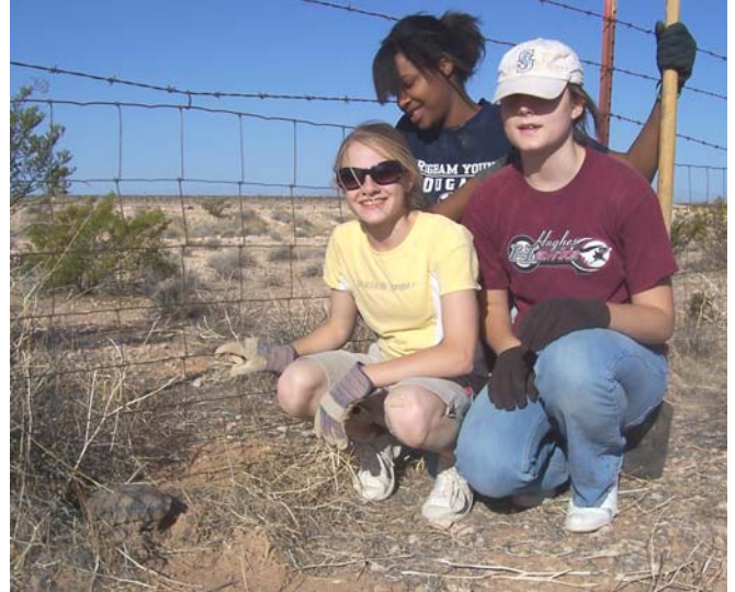
Tortoise fencing will save this tortoise's life

tortoise was and kept on working. Half an hour later he had actually inched a little further under the fence, so I picked him up and moved him back 20 feet under a creosote. You couldn't script a moment like that—it was too cool!