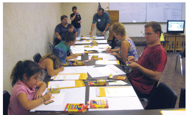
Parents and kids create great tortoise pictures!

away. If I couldn't see the tortoise, I gently slid a piece of PVC pipe down the burrow a bit at a time. Then I'd stop and listen for movement. In one case, that stirred up the tortoise enough that it moved around and we could see it. The combination of movement in the burrow and light from the mirror often stirs the tortoise's curiosity to come and check on what's happening—much to the relief of the worried owners. That's just what happened in the other cases-- they strolled out. So far, all tortoises are accounted for.