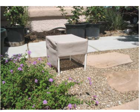
2. Sew a snug cover from shadecloth, leaving 2-3" each leg uncovered