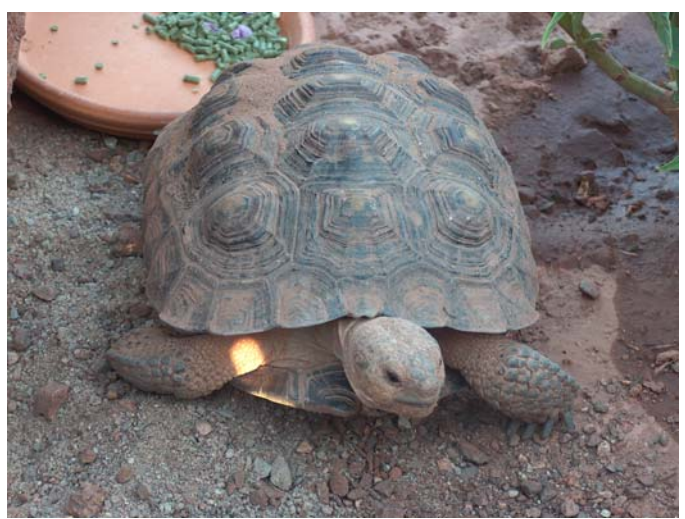
Good new growth (curved not pyramided) shows on Trekette's scutes since she began eating MegaDiet

TG The amounts listed on the package are more like minimum amounts. You can safely give your little tortoise as much MegaDiet as it wants. However, you do want the tortoise to learn to browse so that it doesn't depend entirely on you for food. Giving it desert willow flowers and letting it browse on grass, dandelions, and flowers is perfect. That way, it can feed itself and you don't have to worry when you are not at home to offer MegaDiet.