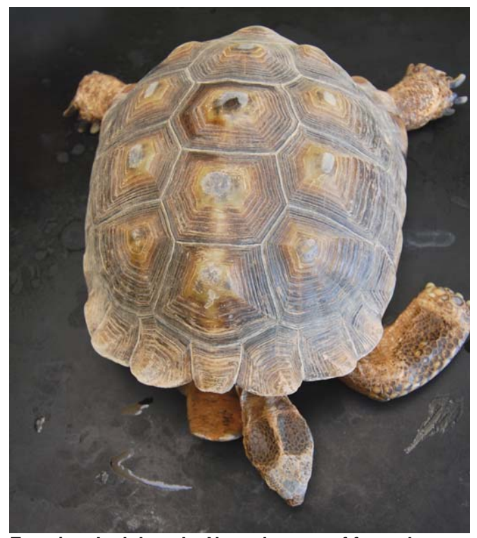
Emaciated adult male. Note absence of fat pads on head and limbs; skull and arm bones are visible

trained staff. This evaluation is vital in determining if a tortoise needs extra care or advanced rehabilitation in our medical center, or if it is healthy and can be moved to an area with a burrow and native grasses and plants.