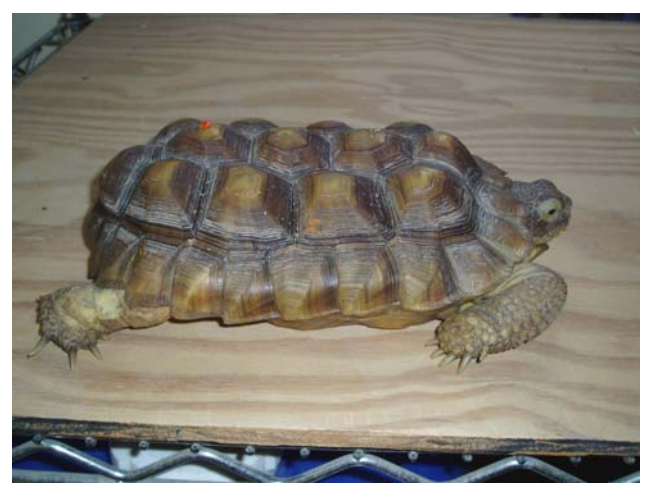
Malnourished tortoise: soft shell, pyramided scutes, splayed hind nails and can't support its own weight

Soft shell – Even if your tortoise has a proper diet, it must get free access to heat and light outdoors from the sun. Otherwise, it is not able to properly digest its food so it sucks calcium out of its bones and shell, causing them to become soft. When people keep tortoises indoors, particularly young tortoises and hatchlings, these tortoises literally turn to soup from the inside out. Think of it this way – every day that a tortoise lives indoors is a day that it spends dying .