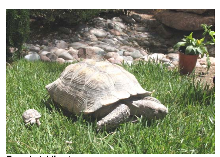
From hatchling to grownup

The August meeting will continue the same effort, refining and reworking. Watch for it! The September meeting will bring the unveiling of the New Tortoise Group!