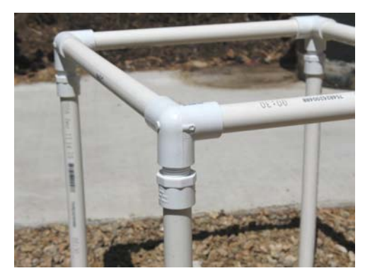
1. Build a frame 12" x 12" x 14" high from PVC pipe

When we put out MegaDiet pellets so that our tortoise can browse whenever it likes, the birds swoop right in and eat up all the MegaDiet. They love it, too! What is the solution? Build a blind that allows the tortoise to enter but is intimidating to birds and keeps them out.