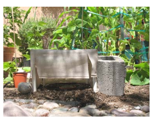
3. Insert legs in ground until side cloth lies on ground 2-3". Hold cloth sides down with something heavy. Slit front cloth so door flaps.