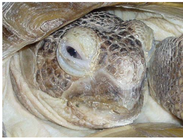
Nutritional deficiencies cause bulging eyes

Bulging eyes – Bulging eyes may be from nutritional deficiencies, or it can be related to a disease process. It is often seen in combination with soft shell and/or discoloration.