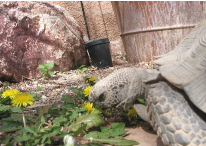
Mmmm. Dandelions-my favorites!

If you have a mating pair of desert tortoises, be prepared for hatchlings to arrive from late August through September. Since it is not legal to give tortoises to another person, please call the Pet Desert Tortoise Hotline at 702-488-9422 to pick up the hatchlings and take them to the Desert Tortoise Conservation Center where they will be cared for.