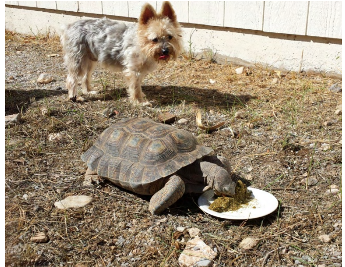
Dash, from the Desert Tortoise Conservation Center, digs into his MegaDiet on Day 1 at his new home. Missy LOVES her new brother. Dash is too large to translocate to the desert.

Winter winds. Last January when it was windy and cold, I wadded up a ball of newspaper, taped it so the paper would stay in a ball, and stuffed it in the mouth of Tad's burrow to cut down on the air circulation. I took it out after a few weeks when the weather warmed.