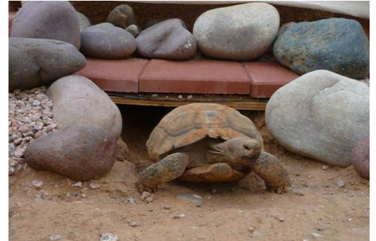
Father Tortoise poses in front of his beautiful new burrow!

And I see from the July newsletter that that is normal. If you build that den to your website's specifications...it stays at about 88°. I found a good home for my female (they added her in their will! and followed your same den building instructions) so that I am no longer adding to the over-population problem.