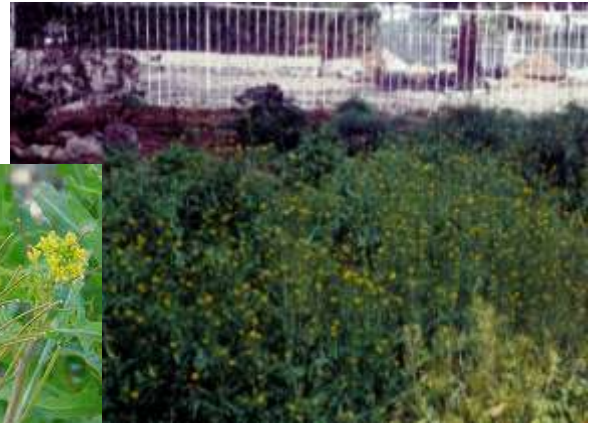
Field of tall, mature mustard

Yellow mustard blossoms can easily grow 1-2 feet high