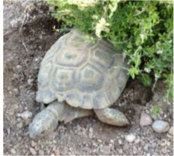
Pepita's right limbs atrophied from a rubber band that blew into the burrow.

No tortoise? Adopt one this year! Begin by submitting an Adoption Application