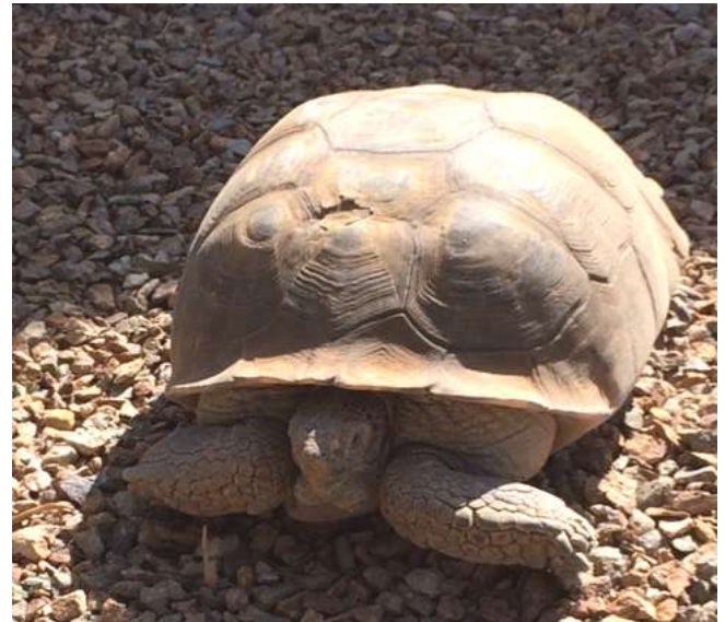
Again this year, Chuck Norris is the first tortoise reported out -- February 16.