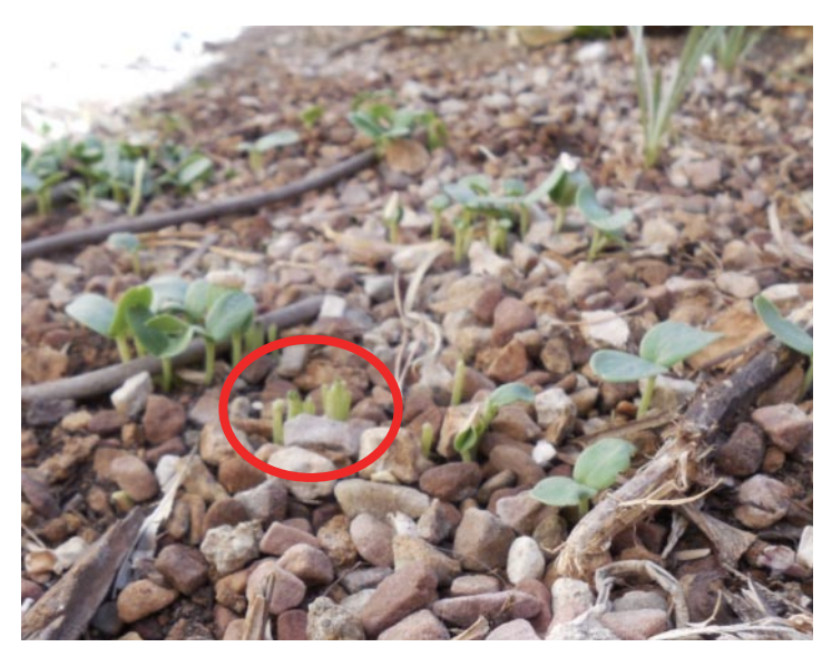
Cantaloupe seeds sprout in about 7-10 days. Notice that the first to sprout (circled) have disappeared!

Spread cantaloupe seeds, pulp and all, on prepared ground, (see picture above). Cover lightly with soil, pat a bit, and keep damp.