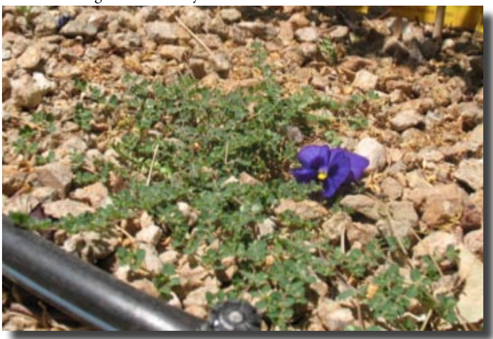
Spurge grows near sprinkler, sidewalk runoff, in lawns. Yummmm!