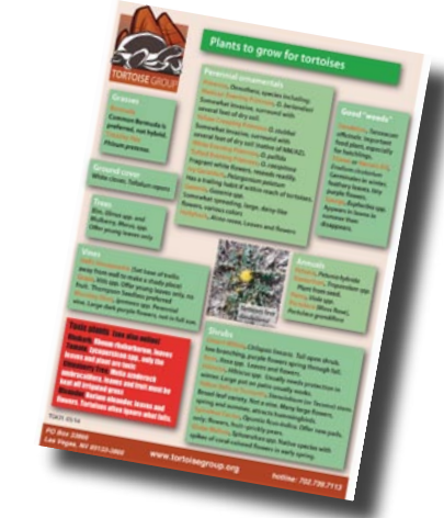
Check our plant info sheet online

Slowly taper off MegaDiet RF. Outside, plants are dying off and tortoise will eat drier, more fibrous foods. Allow tortoise to browse on the drier plants. Don't confuse the tortoise with greens or starchy foods.