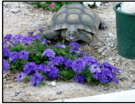
Dippity munches on her favorite flowers