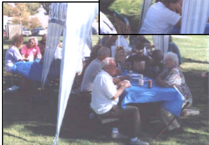
Tortoise Group members, families and friends talk tortoise at the Annual Tortoise Group Picnic in October.