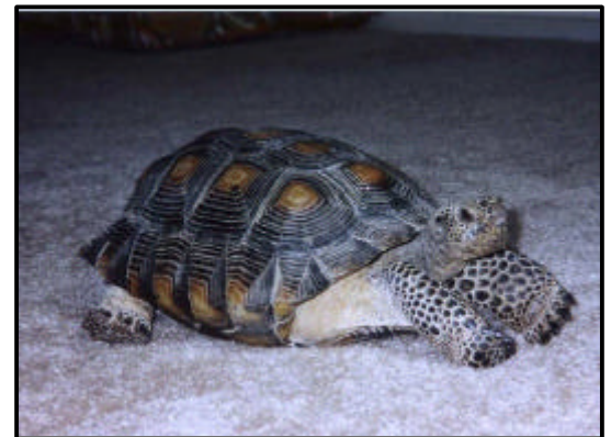
Tad relaxes indoors

Spring emergence is a good time to check your tortoise: Eye lids should be open, not sunken or swollen. Nostrils dry and open. Shell and soft parts free of lesions and ticks. But also, look at the tongue and roof of the mouth for white, cheesy-like lesions. Spring is also a good time to weigh and measure, and to plant those dandelions. Write Tortoise Group for Information Sheet #13, "How to Transplant Dandelions." Include a self-addressed, stamped envelope.