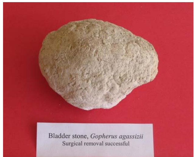
Bladder stone measures about 3 ½" x 3" x 2" thick

10% discount to TG members who show their cards