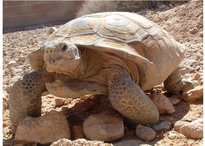
Caesar surveys his kingdom