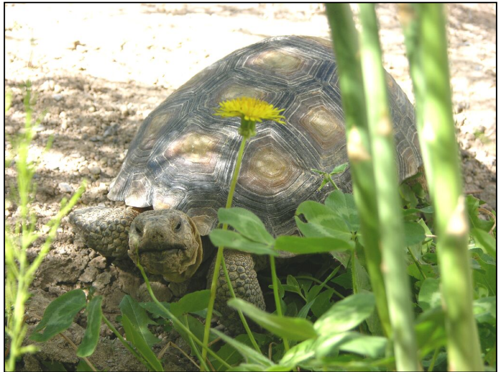
Shelldon, happy to be alive

Information Sheet #25 on the Tortoise Group website gives details on how to treat tortoises that appear to have drowned. I hope that people with water features in their yards will read the sheet and know not to give up even if their tortoise looks really dead. I now have short fences around the water hazards and I am looking forward to my friend's emerging from his burrow soon.