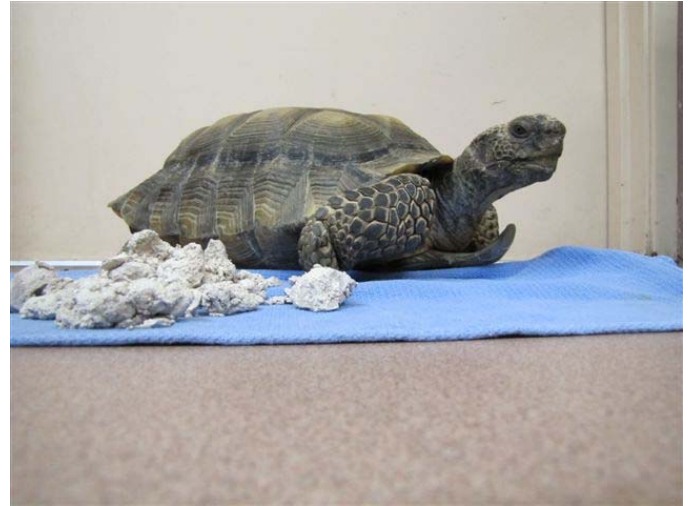
4 ounces of material from two 1 1/2-in bladder stones removed through Tad's left rear leg hole in a 3-hour surgery. Stones were painstakingly crunched into smaller sizes inside the bladder.

box with a tortoise-sized opening. We have a full-spectrum light for daytime. To keep the temperature at 85° at floor level, we use a small electric heater. It's much hotter higher up in the room.