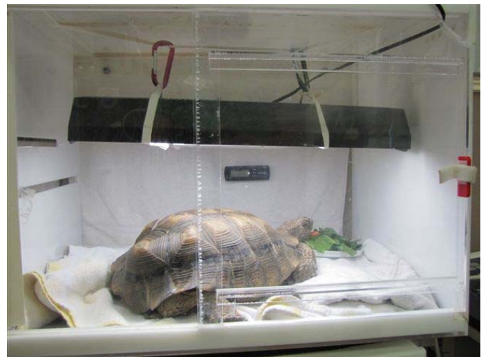
Tad is his ICU cage that is kept at 85°F for constant healing