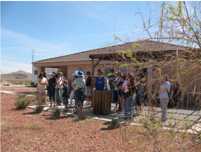
Tortoise Group members on patio of main building of the Desert Tortoise Conservation Center during April 2011 field trip