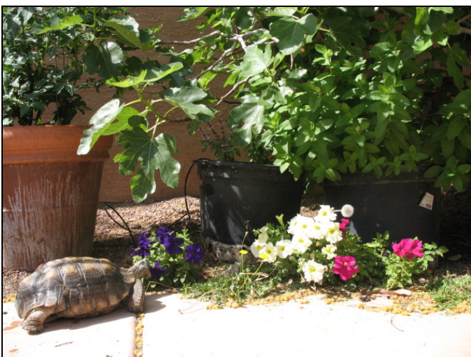
Salad bar allows tortoise to browse flowers and dandelions along patio edge. Note poisonous tomato plant is out of tortoise's reach in pot (left)

Eating Habits While in spring my tortoise was eating everything in the yard and lots of MegaDiet, in the hot summer, he eats like I do—not so much. When I put his MegaDiet in front of him sometimes he walks right through it or eats just a bite or two. And he changes his preferred plants each season.