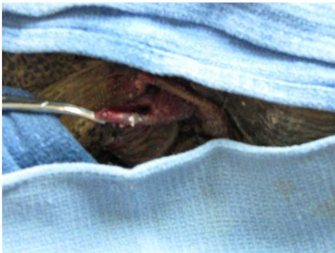
Exposed bladder showing hole where stones will be removed

To enable continuous healing, his body temperature must be kept at about 85°. We lined the bathroom floor with cardboard to protect it from urine and feces, and made a “burrow” from an upside down