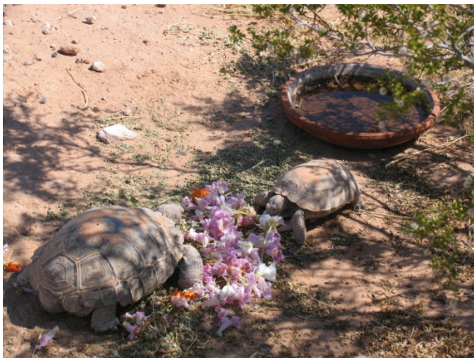
Shelly and Speedy enjoy their daily treat of blossoms from a desert willow tree

Exterior Marking Workshop. Two methods of identification are best. We will show you how to safely apply your phone number to the shell of the tortoise. You can watch or practice. Leave the tortoise at home. The Lost Tortoise Prevention Kit will be available for $10.00, also online.