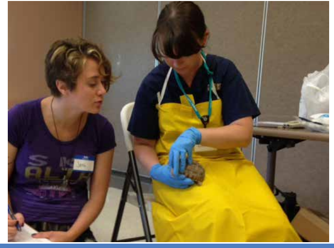
Due to great demand...a second clinic is scheduled for August 22, 2015 10 am – 2 pm at the Henderson Multigenerational Center, 250 S. Green Valley Parkway, just south of 215.

The event was sponsored and staffed by Tortoise Group, the US Fish and Wildlife Service, and the Nevada Department of Wildlife. All the tortoises received health screenings and external tags. Additionally 73 desert tortoises received free microchips and are now registered in the Tortoise Group system which includes their microchip number, external tag information, and custodian's name.