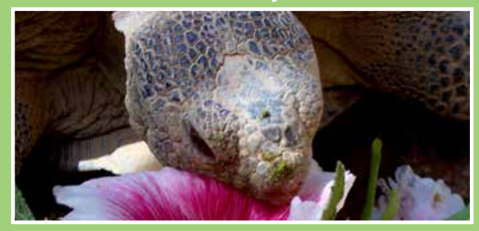
I'd like to tell you the history of our old tortoise ...

Back in the late 1970's, my husband found a tortoise walking down the sidewalk. A door-to-door search brought no results, so he brought her home.